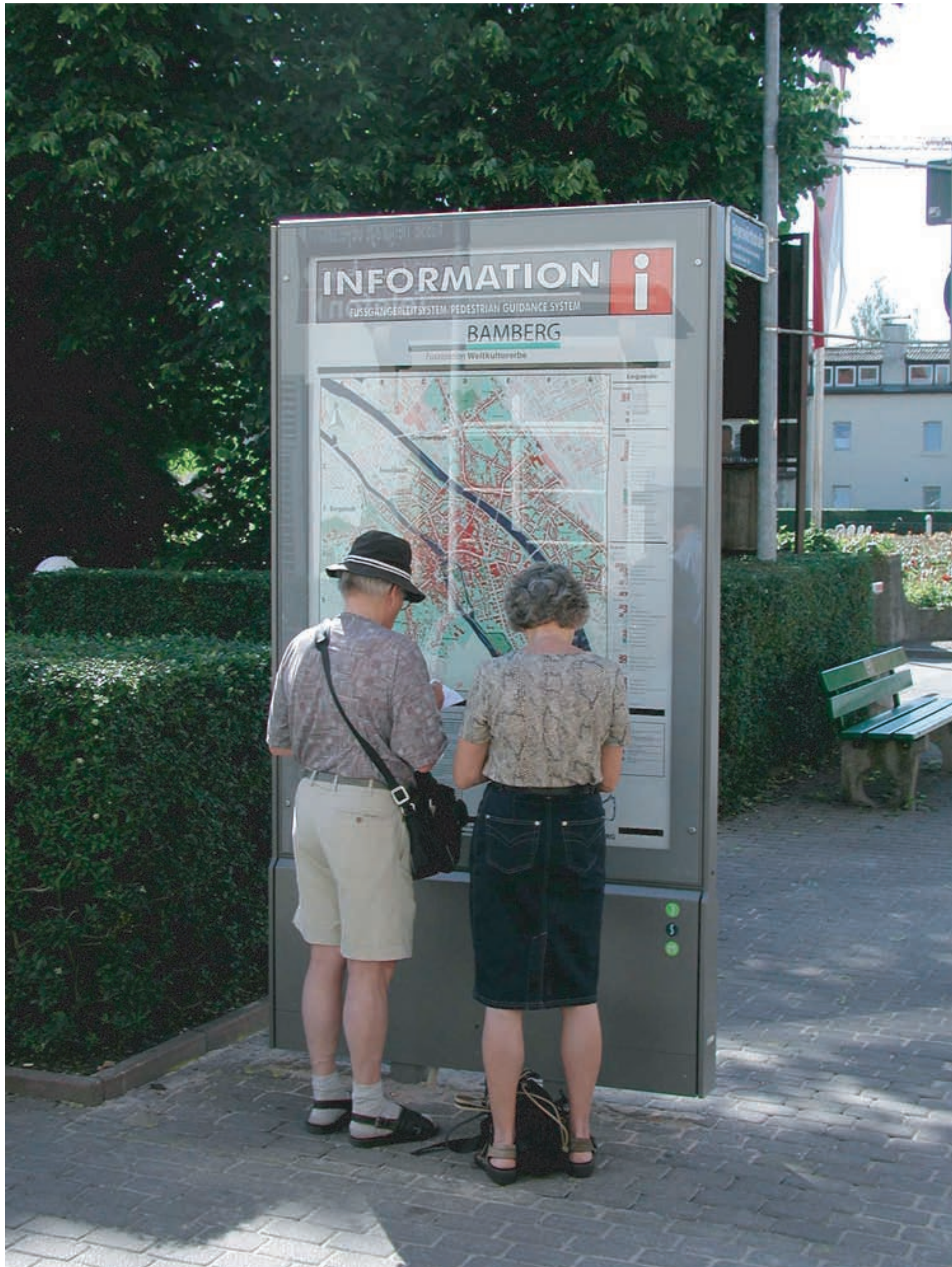
Information point with detailed city map