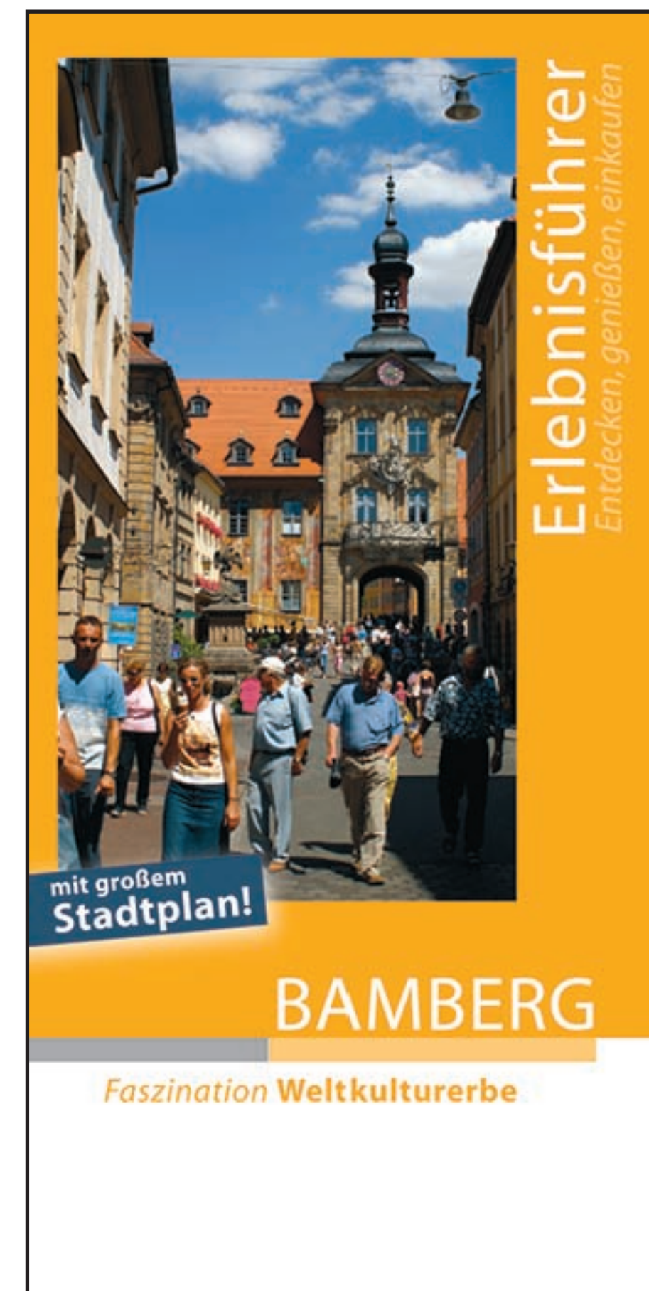
Printed city map